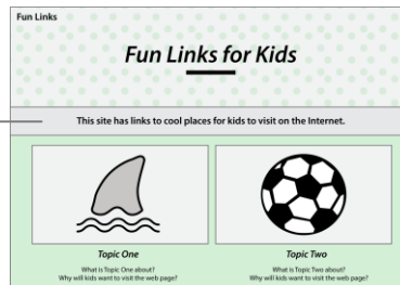
Example Home page.

Describe the purpose of the web site. What is it about?